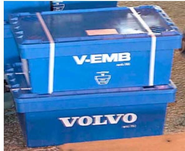
Nestable boxes has a cost reduction potential of 60%

Several potential customers are now evaluating Volvo’s blue box system. Presently many OEMs and automotive suppliers are using a non-nestable small box system. Non-nestability creates extra costs when it comes to the transportation of empty boxes. The cost reduction potential is about 60% if the customer goes for a nestable system, a figure which is very interesting for companies focusing on cost savings. The environmental effect is also an important parameter.