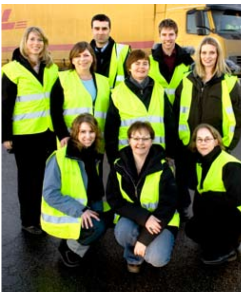
The Customs department at Inbound