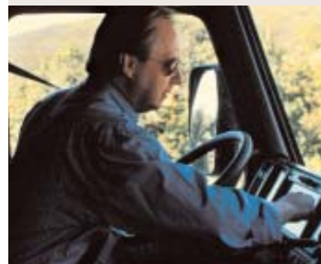
Studies of accidents involving truck drivers show that use of a seat belt might have prevented or reduced injuries in at least 60% of cases.