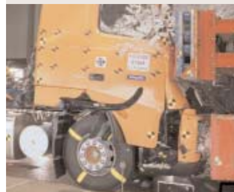
Single accidents involving trucks are simulated using the Swedish cab strength test – the toughest and most realistic safety test in the world. Collisions between two trucks are simulated by means of Volvo's unique barrier test.

In the last decade, collisions between cars and trucks have acquired a new focus. Frontal collisions between cars and trucks represent the biggest single contributor to fatal traffic accidents. Volvo Trucks leads the world in the development, testing and production of frontal protection systems designed to reduce the consequences of such accidents.