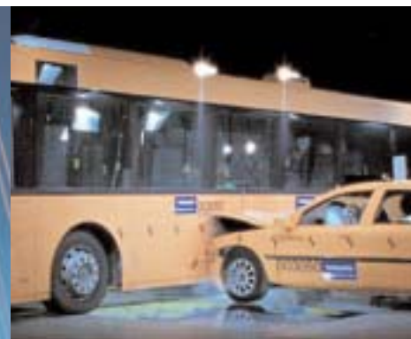
Volvo Buses also carries out full-scale collision testing to assure the safety of passengers in low-floor buses. The test shown here is between a car and a city bus.