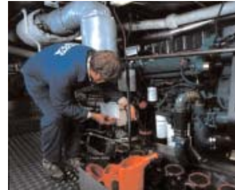
Volvo Penta carries out 'certified installations' to ensure that engines are installed correctly at boatbuilders' premises.

Volvo in the area of Human Machine Interface (HMI) is carried out by Volvo Technology.